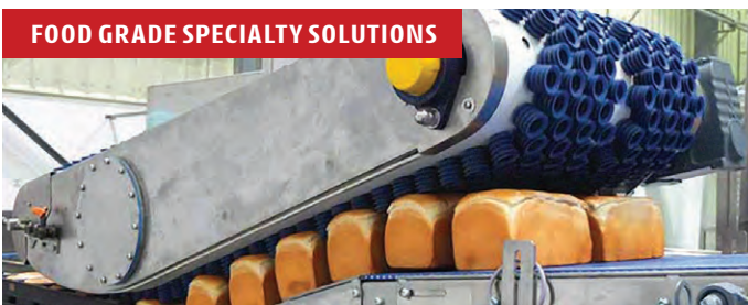
FOOD GRADE SPECIALTY SOLUTIONS