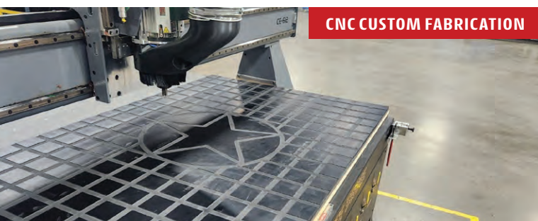
CNC CUSTOM FABRICATION