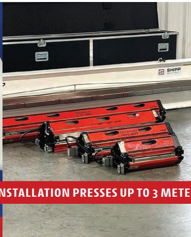
INSTALLATION PRESSES UP TO 3 METERS