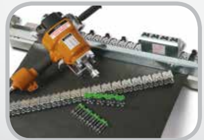
Select installation method