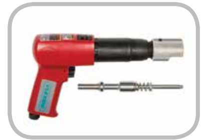
Air Powered Rivet Driver

*Includes Air Powered Rivet Driver, Retaining Spring, and Drive Rod with Hold Down Spring and Washer.