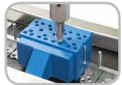
Air Powered Rivet Driver Installation

The heavy-duty tool allows for more compression of fastener plates resulting in a smooth and consistent splice that is compatible with conveyor components.