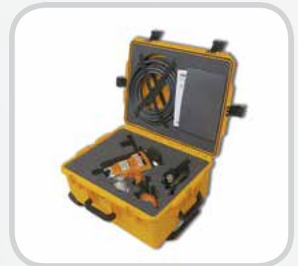
The Pneumatic Single Rivet Driver is protected by a portable carrying case