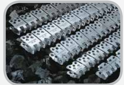
Select fastener size