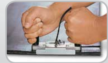
Flexco® Belt Groover

When the belt grip is slipped over the belt edge at a right angle, belts can be pulled without damaging the belt surface.