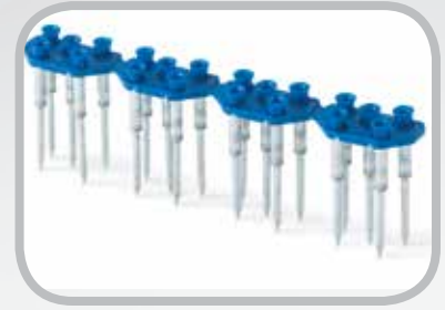
Rapid Loader™ Collated Rivet Strips