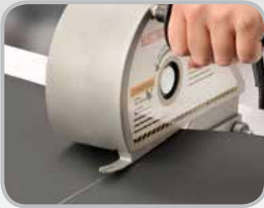
Electric Belt Cutter