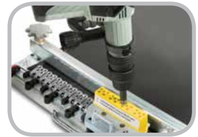
Electric Powered Rivet Driver Installation