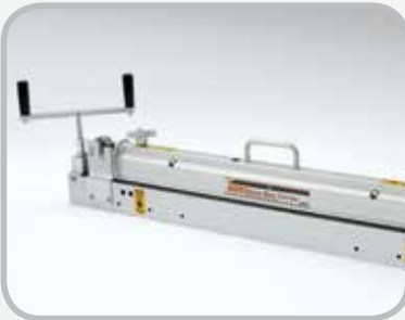
900 Series* Belt Cutter