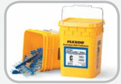
Conveniently packed, easy-to-use