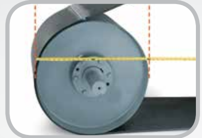
Measure smallest pulley diameter