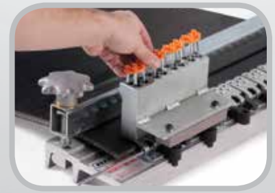
Speed Installation Time