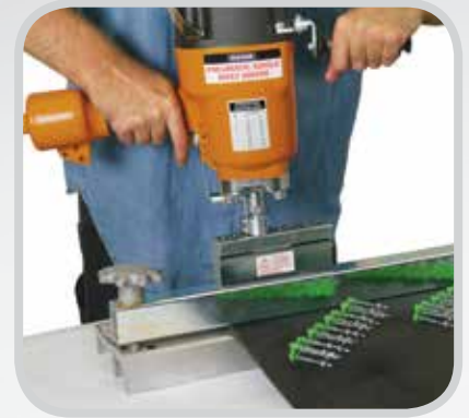
Consistent, long-lasting splice every time