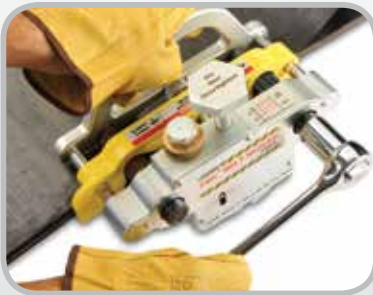
FSK™ Belt Skiver