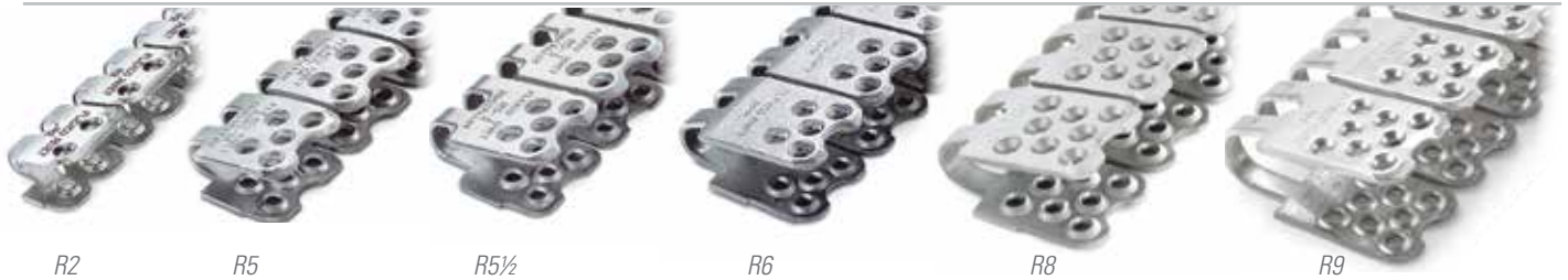
Flexco® Rivet Hinged Fastener Selection Chart

Use the charts below to match the Flexco® SR™ fastener to your needs. Find the fastener metal type required for your application. Then choose the ordering number that corresponds to your belt's width from the charts on the following pages.