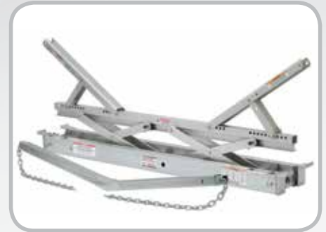
Flex-Lifter™ Belt Lifter