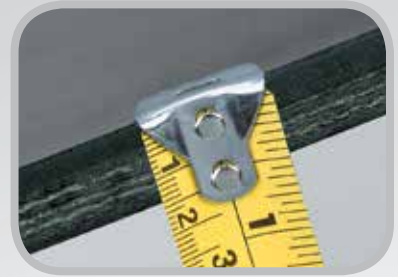
Measure belt thickness