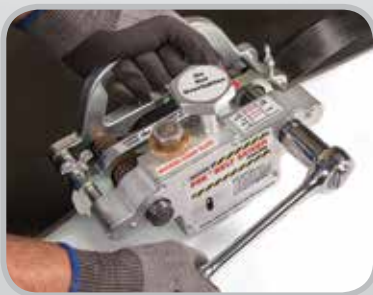
FSK™ Belt Skiver with metal fence