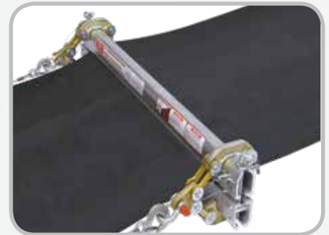
Far-Pul™ HD® Belt Clamp