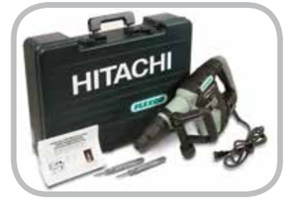
Electric Powered Rivet Driver

**For use with previous model: EPRDVS-1.