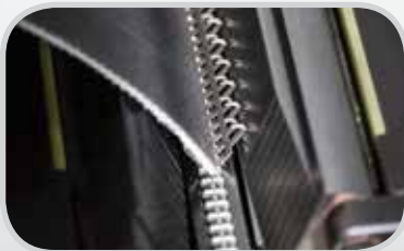
Clipper® production lacers — the quickest, most precise method for high-volume installation of G Series™ lacing