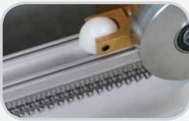
Clipper® maintenance lacers — quick, on-site installation of G Series™ lacing with precision Roller Lacing Technology™